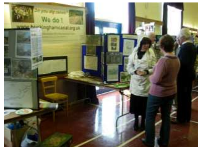
BCS at Deanshanger Historical Society's Open Day